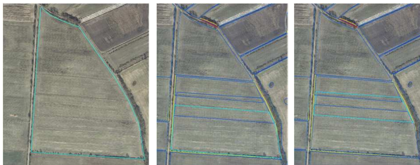
Reference parcel (RP)